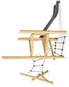
2 Tower & Net