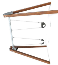
4 Double Swing