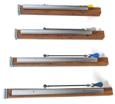
3 Musical Chimes